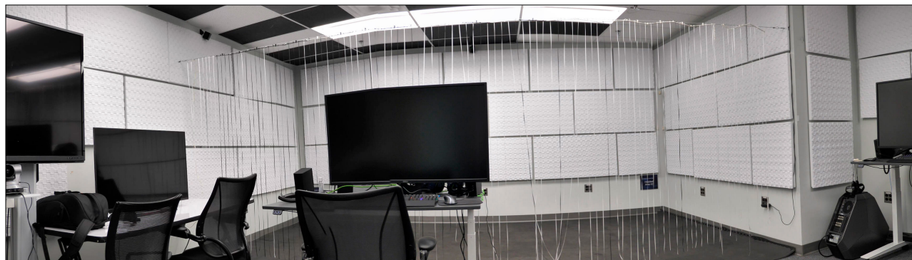
Figure 1. Immersion Central. The space has padded flooring and walls for safety and is equipped with computers with high-end graphics processing units and 4K monitors, stereoscopic cameras, and various AR/VR/MR headsets, among other items. The space is open 24 hours a day, 365 days a year.

experience room-scale, enterprise VR environments using the HTC VIVE or Oculus Rift equipment. There are three workstations where staff can develop XR applications while tethered to the computer. These stations are on motorized tables, which allow the user to stand while testing or using an application. A small inventory of popular commercial XR devices is available for staff to borrow for sponsor demonstrations and testing. Immersion Central is also equipped with independent media production capabilities, including ample room to record, enhanced acoustics, and tools to simplify the media production and transfer.