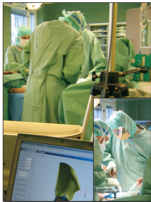
Figure 3. Ongoing clinical research with BGS at Orton Hospital in Helsinki, Finland.

Through an ongoing collaborative effort among APL, the JHU Whiting School of Engineering, JHU Bayview Medical Center, and Orton Orthopaedic Hospital, a multi-threaded approach is implemented to further develop the BGS navigation system, enhance its theoretical foundation for the real-time calculation of the contact pressure within the joint, and evaluate its functionality and reliability through cadaveric tests and clinical research. To date, we have performed 13 cadaver tests to validate the current version of the BGS and have successfully performed 11 clinical tests (Fig. 3).