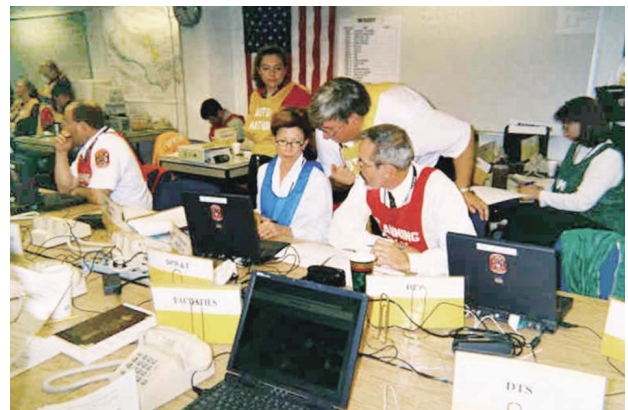
Figure 3. Montgomery County public health officials review data that have come in from area hospitals.

Although ESSENCE II's ability to detect a biological attack was not tested in this scenario, the tool proved to be valuable. The county epidemiologist and disease control practitioners had access to data, including specific patient symptomatology, and this enhanced their ability to effectively communicate with the hospitals, assist in resource management, and develop appropriate response plans.