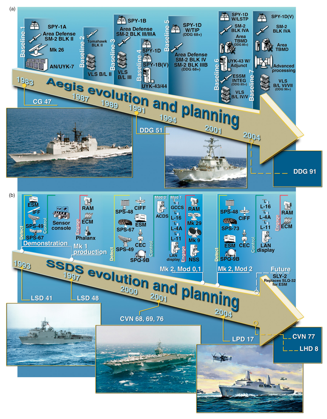
Figure 2. Evolution and planning of (a) Aegis and (b) the Ship Self-Defense System.

the impact of the environment on radar and missile performance. Sylvester et al. note that the combat system must be adjusted to the local environment to optimize missile performance. The equipment and computer programs developed by APL and how they function as part of the combat system are also briefly discussed.