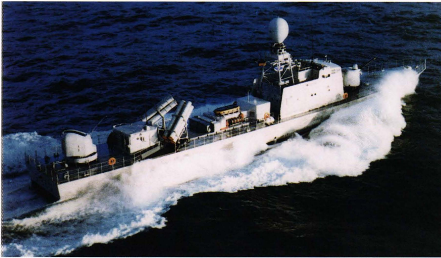
Figure 1. High-speed patrol and attack surface craft, such as operated by the Turkish Navy (top) and by the Italians (bottom), are capable of launching torpedoes and antiship cruise missiles and thus present a potential threat to naval forces in littoral areas. The craft employ modern platform and weapons technology and are being designed and developed by several countries and exported to the Third World.