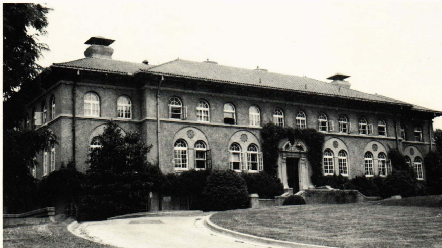
Geophysical Laboratory, Carnegie Institution of Washington.

Today, people are still trying feverishly to implement, without much knowledge of the past, the wis-