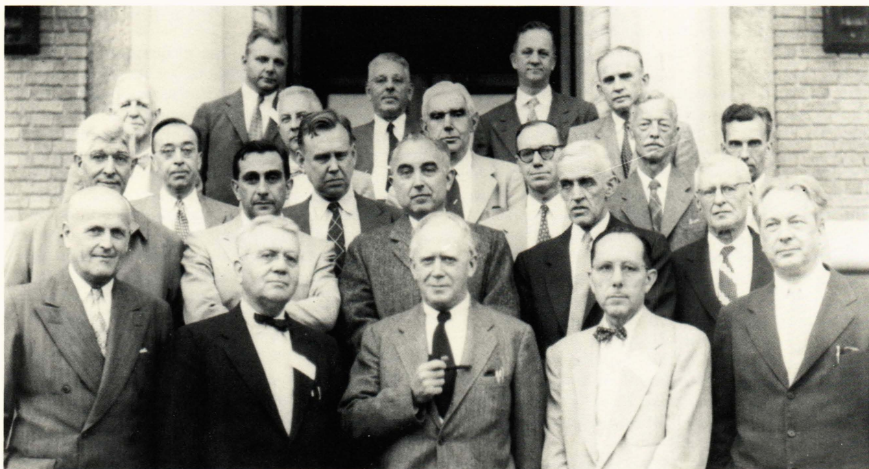
The Washington Physics Colloquium at its final meeting on April 29, 1954. The diagram identifies those who attended (including three directors of The Johns Hopkins University Applied Physics Laboratory).