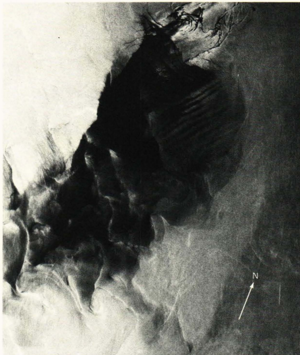
Fig. 2—Complex radar backscatter patterns in a nearly calm 100 km square region of the ocean located just outside the mouth of Chesapeake Bay. The dark regions generally correspond to low surface winds (less than 2 m/s), but the patterns also indicate a wide variety of current-generated interactions having only indirect relationship to the wind. Wind and current interactions were discussed by Ross, Delnore, and Boicourt. (JPL digital product, pass 1339)

Duncan Ross of the NOAA Sea-Air Interaction Laboratory used simultaneously collected aircraft and spacecraft measurements to show an apparent