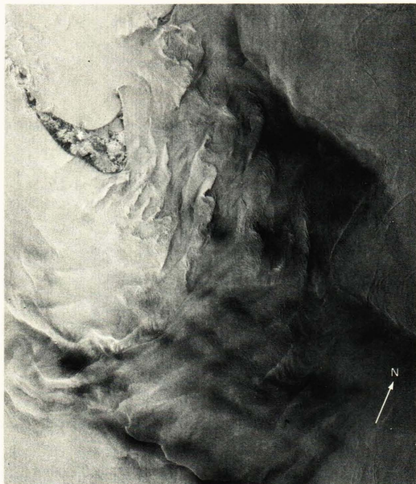
Fig. 1—100 km square image of Nantucket Shoals provides a dramatic illustration of bathymetric expressions occasionally evident over large areas. Most of the area included in this image is less than 40 m deep, much of it is less than 20 m deep, and portions are less than 2 m deep. Bathymetric expressions were discussed by Apel and Shuchman. (JPL digital product, pass 880)

area. Clearly, the SAR's limitation in sensing only surface phenomena does not exclude it from appearing to penetrate the surface, since internal phenomena often generate surface expressions.